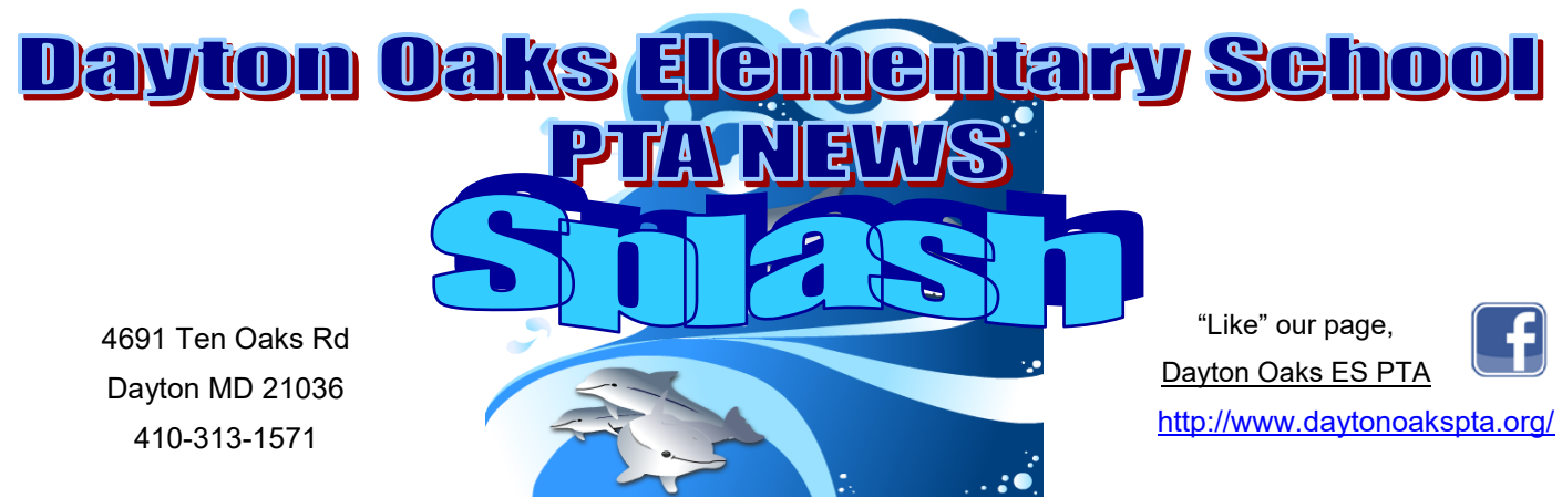
Week of October 10, 2016